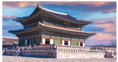
Gyeongbokgung Palace, Seoul

Begin your Korean adventure by delving into its culinary traditions with a professional chef, learning to prepare classic dishes like Bulgogi and Sukju Namul. Follow this with a leisurely stroll along Cheonggyecheon Stream, an urban oasis recently reclaimed from beneath a highway, offering a blend of history and modernity. Explore the vibrant Gwanghwamun Square, home to museums, outdoor artworks, and dining options, providing splendid views. The journey continues to the historic Gyeongbokgung Palace, the former royal residence of the Joseon Dynasty, and the War Memorial of Korea, each narrating stories of the nation's past.