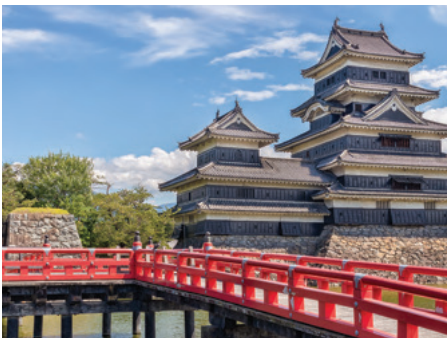
Matsumoto Castle, Nagano

Explore Sannomachi Street in Takayama's old town, engaging in a sake tasting session and visiting the Matsuri no Mori Museum, which exhibits the rich heritage of the Takayama Festival. Continue to Matsumoto to view the striking Matsumoto Castle, distinguished by its black exterior and nicknamed "Crow Castle." This historic site stands as one of Japan's most important castles and is the oldest existing five-structure/six-storey castle in the country.