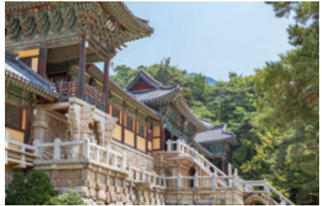
Bulguksa Temple, Gyeongju

Take the KTX train to Gyeongju, once the capital of the ancient Silla kingdom. Explore Bulguksa Temple, a testament to the golden age of Buddhist art, and Seokguram, a man-made cave temple of remarkable craftsmanship. Wander through Tumuli Park, home to over two dozen unique tombs from the Silla period. Conclude the day by settling into a hanok, offering an authentic traditional Korean lodging experience.