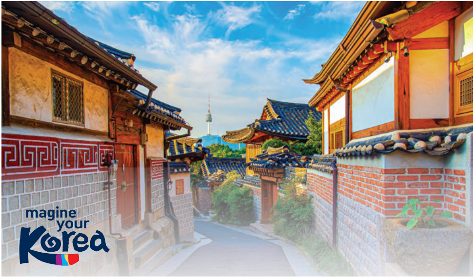
Bukchon Hanok Village, Seoul