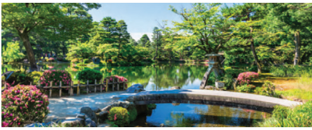
Kenrokuen Garden, Kanazawa