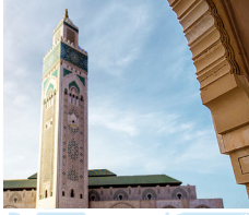
MOROCCO - LAND OF ENCHANTMENT APR 15 - MAY 1, 2025