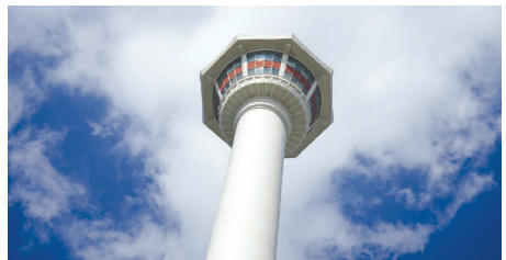
Busan Tower, Busan

Head to Busan and begin your exploration at Songdo Skywalk, a 365-meter promenade offering scenic views over the water from Songdo Beach. Next, visit the 120-meter-high Busan Tower, an emblematic symbol of the city. Explore Jagalchi Market, Korea's largest seafood market, bustling with vibrant stalls and fresh catches. Continue to Huinnyeoul Culture Village, set on Yeongdo's cliffs, offering quaint coastal charm. The journey culminates at Gamcheon Culture Village, known for its colorful houses and winding alleys, artistically set against the hillside.