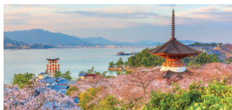
Miyajima Island, Hiroshima

Begin the day with a coach tour, visiting the historical Nijo Castle, an architectural marvel from the Edo Period. Participate in a traditional Japanese tea ceremony, delving into the country's rich cultural practices. Explore Gion, the famed district of Kyoto known for its preservation of traditional arts and performances. After returning to the hotel, the afternoon is free for personal activities. The day concludes with dinner at a local restaurant, complemented by an enchanting Maiko dance performance.