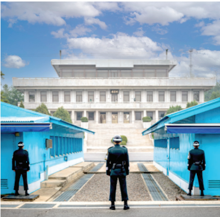
Joint Security Area in DMZ

Journey to the Korean Demilitarized Zone (DMZ), the stark border between North and South Korea. Visit key sites including Imjingak Park, the symbolic Freedom Bridge, and the clandestine Third Infiltration Tunnel. Gain unique perspectives of North Korea from the Dora Observatory and explore Dorasan Station, the northernmost railway station in South Korea. After exploring these poignant and historic sites, return to the hotel for a leisurely evening or further personal exploration.