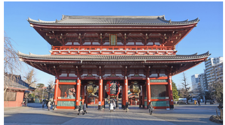
Asakusa Kannon Temple, Tokyo

Start the day visiting Tokyo's serene Meiji Jingu Shrine, steeped in tranquility and tradition. Dive into the culinary world with a sushi-making session, then wander through the lively stalls of Tsukiji Outer Market, famous for its fresh fare and rich history. Continue to the venerable Asakusa Kannon Temple, a beacon of the Edo period, and meander along the Nakamise Shopping Arcade, where a variety of traditional garments, handicrafts, and snacks invite exploration.