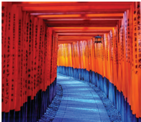
Fushimi Inari Shrine, Kyoto

Enjoy a day at your own pace, followed by a journey to the airport to catch a flight to Osaka. Once arrived, proceed with a transfer to your hotel in Kyoto.