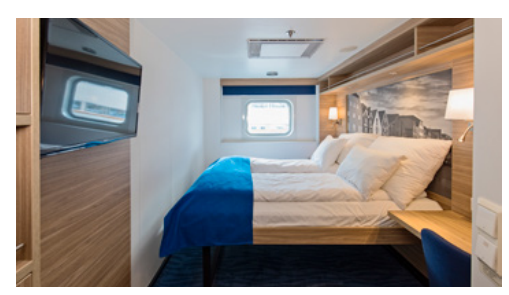
Arctic Superior Cabin