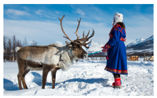
Sami people in Lapland