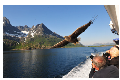
Sea Eagle Safari

This morning, view Mount Hornelen which stands 860 metres above sea level. Cruise past the West Cape and cross the open sea for the first time on this voyage, before navigating through skerries and islands to reach Ålesund.