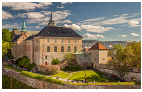
Akershus Fortress, Oslo

After breakfast, travel by train to the town of Myrdal then board the scenic Flåm Railway which takes you on a spectacular journey to Flåm. From there, take an awe-inspiring express boat trip along the Sognefjord, Norway's longest and deepest fjord, and into Bergen.