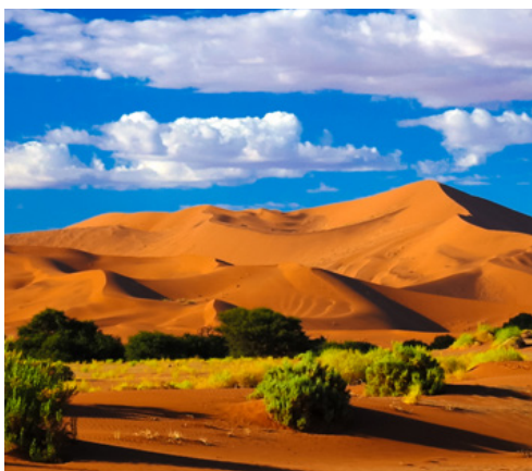
Sand dunes Namib

Climb the giant sand dunes of the Namib Desert for a panoramic view in the early morning. Open-top vehicles take you along an unpaved sandy track to the vlei, a salt-clay sink surrounded by sand dunes. Watch for oryx antelopes and springboks. As the sun sets, enjoy a romantic ride through the stunning desert landscape. Overnight in a lodge.