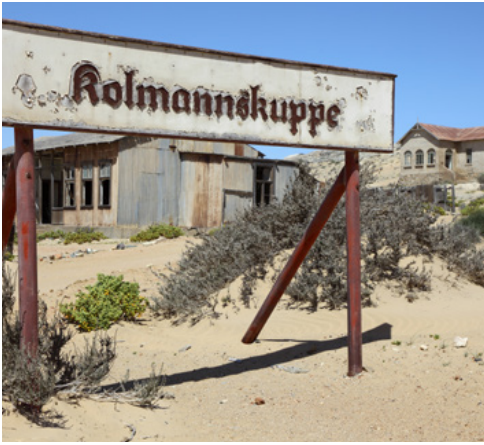
Kolmannskop (Ghost Town)