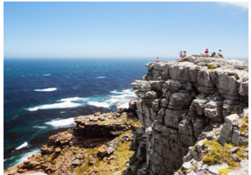
Cape of Good Hope

Tour Chapmans Peak Drive, Cape of Good Hope, Boulder's Beach (where you might see penguins) and Kirstenbosch Botanical Gardens.