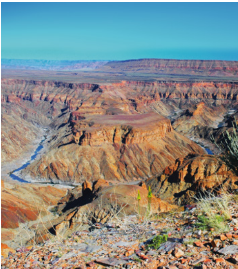
Fish River Canyon

Arrival in Holoog. Begin this special day with a visit to Fish River Canyon, the largest canyon in Africa and the second largest in the world. It is also the second most visited attraction in Namibia. Enjoy a scenic canyon excursion from the comfort of the bus and embrace the stunning views. Hop off the bus and take a short walk along the canyon's edge.