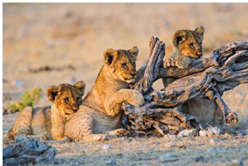
Etosha National Park

Explore the wonders of Etosha National Park. Ride in comfort in air-conditioned buses across the entire park and observe elephants, gnus and more, up close. The Etosha Pan – the largest salt pan on the continent – lies at the heart of the Park. This shimmering “great white place”, as its name says, is teeming with wildlife. The unforgettable day ends with an overnight stay in a nearby lodge.