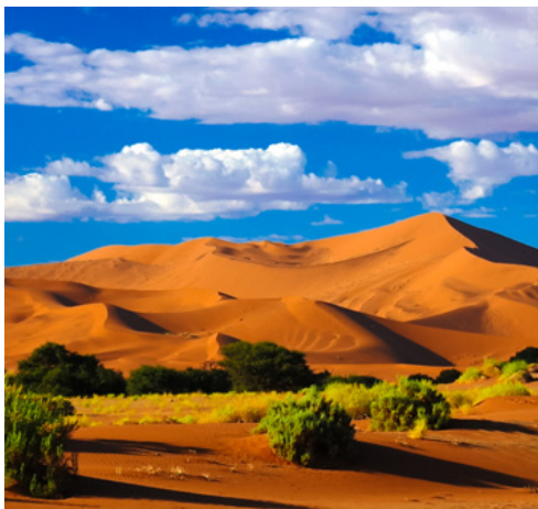
Sand dunes Namib

Climb the giant sand dunes of the Namib Desert for a panoramic view in the early morning. Open-top vehicles take you along an unpaved sandy track to the vlei, a salt-clay sink surrounded by sand dunes. Watch for oryx antelopes and springboks. As the sun sets, enjoy a romantic ride through the stunning desert landscape. Overnight in a lodge.