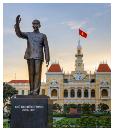
Ho Chi Minh Statue, Ho Chi Minh City

All five senses will enjoy this two-wheeled tour of Ho Chi Minh City. This Vespa adventure begins in busy, historic District 1. In Chinatown, see century-old shops nestled amid modern buildings. Listen for the chirping of the bird street market, where locals shop for their singing pets. Appreciate the aroma of coffee beans at a roasting workshop, then savour a sample of Vietnamese coffee, iced or hot. Zigzag through District 4, and then go souvenir shopping at Ben Thanh Market. In the evening, see a performance of the acclaimed A O Show (pronounced Ahhh! Ohhh!) at the Saigon Opera House.