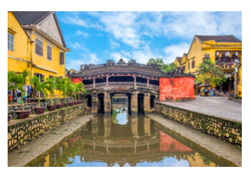
Japanese Bridge, Hoi An

A visit to the village of Tra Que, renowned for its organic herb and vegetable gardens, includes a hands-on opportunity to help farmers prepare the land. Using traditional implements, fertilize with seaweed from the nearby river, then water using cans supported on a bamboo pole across the shoulders. An herbal foot massage and scrumptious lunch will reward your efforts. During an afternoon walking tour, see Hoi An's Chinese communal houses, its iconic 400-year-old Japanese Bridge, and the beautifully preserved merchant houses from traders of a bygone era. Devoid of most motorized transport, the UNESCO World Heritage-listed Old Town is ideal to explore on foot.