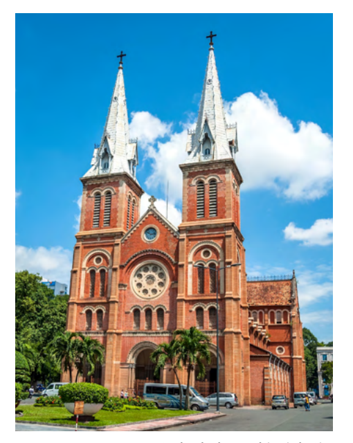
Notre Dame Cathedral, Ho Chi Minh City