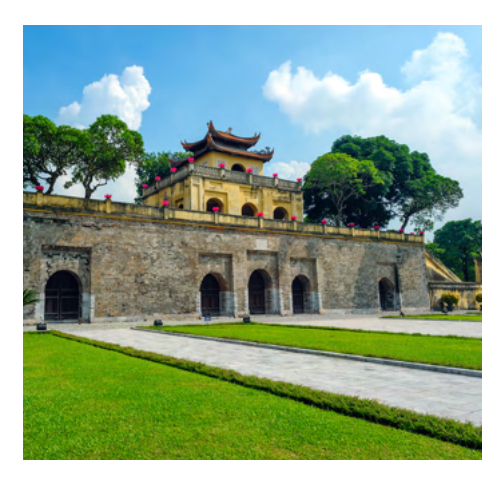
Imperial Citadel of Thang Long, Hanoi

Your first day in Vietnam promises a feast for the senses. From the airport, you'll be taken for lunch before heading to the hotel where you'll stay for three nights. That evening, a guided tour of Hanoi's street food scene will give you a taste of Vietnamese food culture. In the maze of Hanoi's Old Quarter, watch skilled chefs prepare the city's famous banh cuon (steamed rice rolls). Join locals at outdoor barbeque stalls to sample meat, vegetables and breads that have been grilled over hot coals. Finish with a cup of fresh fruit smothered with crushed iced and condensed milk.