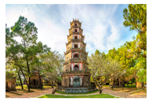
Thien Mu Pagoda, Hue

Early risers can take in sunrise during a morning tai chi lesson on the deck before heading out on kayaks to enjoy the beauty of Halong Bay and its incredible ecosystem. After breakfast, the boat will return to port, passing several fishing villages along the way. Disembark at Tuan Chau marina and head to Hanoi's airport for a short flight to the central Vietnam city of Hue. Check in to the hotel where you'll spend two nights. Remainder of the day is free.