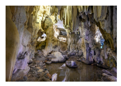
Trinh Nu Cave, Halong Bay

After a 3-hour drive to Halong Bay, board a Bhaya Classic cruise ship and embark on an adventure to discover its emerald waters, hidden pools and mystical islands. Off-boat excursions offer an opportunity to get closer to the region's beautiful landscapes and sandy beaches. Explore Trinh Nu cave, a sunlight-filled, 2,000-square-metre grotto filled with stunning stalactites and stalagmites, or remain on board and take in the glorious vista from the sundeck. As night falls, the boat will drop anchor in a peaceful spot. Sip a drink and watch the sunset over Halong Bay, then enjoy dinner and overnight on board.