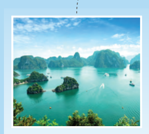
JOURNEY THROUGH VIETNAM

JAN 26 - FEB 13, 2023 South Africa, Namibia