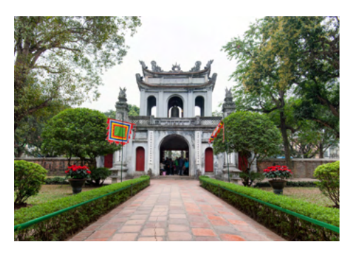
Temple of Literature, Hanoi

Vietnamese cuisine has five fundamental taste elements that you'll learn about during a cooking class and shopping trip with the chef. At a local market, learn about tropical fruits, vegetables, herbs and unusual items like silkworms that are for sale. Back in the kitchen, you'll prepare a range of mouth-watering dishes. The afternoon will be devoted to one of Vietnam's favourite pastimes: coffee! Try an "egg coffee" at Giang Cafe in the Old Quarter, and then visit other quirky cafes such as the atmospheric Cafe Lam, with its walls covered in artwork collected over the decades in exchange for coffee.