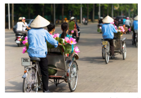
Cyclo in Hanoi

Begin with an introduction to Ho Chi Minh, considered the father of the nation. See "Uncle Ho's" modest bungalow, visit the marble mausoleum where he lies in state and learn about the evolution of Vietnamese independence at the Ho Chi Minh Museum, Visit the Imperial Citadel of Thang Long, a UNESCO World Heritage Site built in the 11th century. Marvel at Hanoi's French colonial architecture, such as the exquisite Opera House, and enjoy the peacefulness of the serene Temple of Literature. On a cyclo tour of Hanoi's Old Quarter, learn about the labyrinthine alleyways that were once an important centre of commerce.