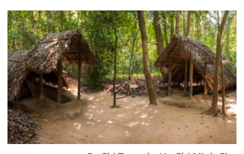
Cu Chi Tunnels, Ho Chi Minh City

A half-day tour to the Cu Chi tunnels, the underground network of passages that are a testament to the determined spirit of the Vietnamese people. Work on the tunnels began during the war against the French in the 1940s. They were expanded to create an underground city almost 200 kilometres long over the next 25 years as the conflict with America escalated. Adventurous travellers may choose to explore inside the tunnels but there is a lot to see aboveground as well. In the afternoon, savour a tasting experience at an artisan chocolate shop in Ho Chi Minh City.