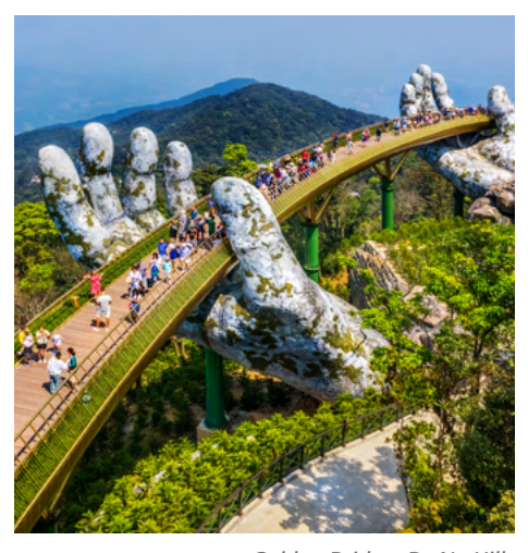
Golden Bridge, Ba Na Hills

Arise early to catch a glimpse of the morning's first light hitting the distant Golden Bridge before boarding a cable car to visit the structure, famous for its giant, outstretched Buddha hands. Breakfast back at the hotel, then take the cable car back to the bottom where your driver will transfer you to Hoi An, a riverside town 30 kilometres south of Da Nang. During the evening's secret cocktail tour, sample five unique beverages in unexpected locations as a knowledgeable host explains the history of the Vietnamese relationship with French, Japanese and Chinese merchants. Spend two nights in Hoi An.