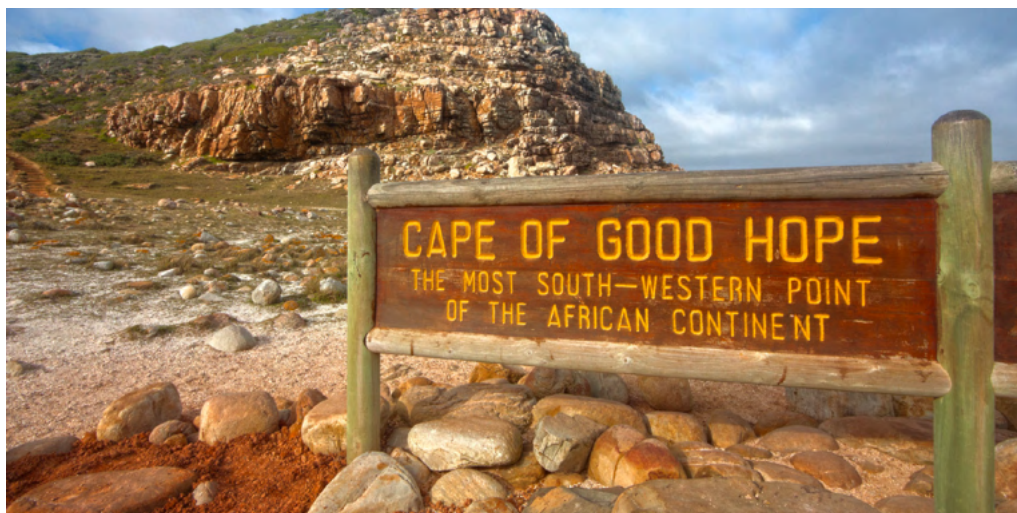
Cape Of Good Hope

After an incredible time in Cape Town, bid farewell and transfer to the airport accompanied by an English-speaking driver and guide, carrying unforgettable memories of your African adventure.