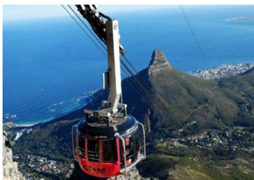
The Mountain Aerial Cableway