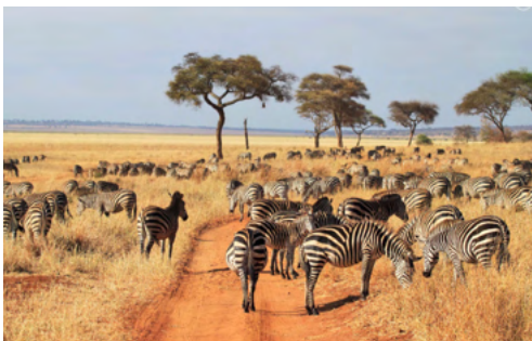
Herd Zebras Tarangire

Spend a full day in Amboseli National Park, enjoying morning and afternoon game drives. You'll have the opportunity to see a diverse array of wildlife in their natural habitats.