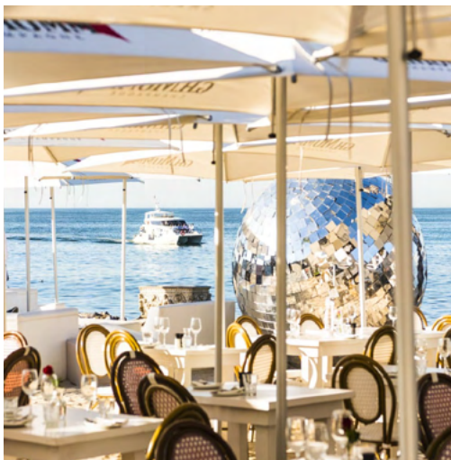
Grand Africa Cafe

Embark on your journey along the majestic Chapman's Peak Drive, taking in panoramic Atlantic views before reaching Cape Point. Here, experience the unique Cape Point Funicular, also known as the Flying Dutchman Funicular. This distinctive railway system in Africa efficiently transports visitors up a scenic incline to the historic lighthouse. Afterwards, explore the Cape of Good Hope, steeped in cultural history and home to an array of wildlife. Savour a seaside lunch at local restaurant. Continue to the Boulders Penguin Colony, a land-based African Penguin community unique to this region. Conclude your day with a farewell dinner with a stunning view and a relaxed atmosphere.