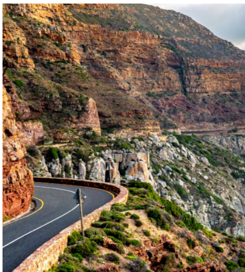
Chapmans Peak Drive