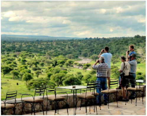
View from Tarangire Safari Lodge

Accommodation: Amboseli Serena Safari Lodge or similar (2 night)