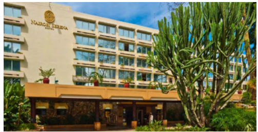
Nairobi Serena Hotel