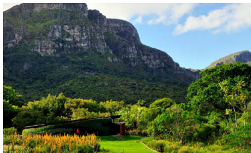
Kirstenbosch Botanical Garden

Accommodation: Queen Victoria Hotel or similar (3 nights)