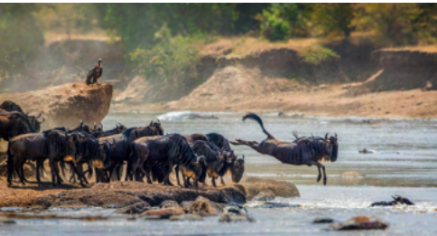
The Great Migration

Accommodation: Serengeti Serena Safari Lodge or similar (1 night)