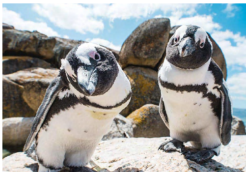
Boulders Penguin Colony