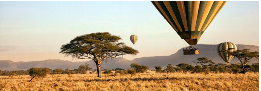
Serengeti Balloon Safari

In the morning, transfer to the Lobo airstrip for your flight to Kilimanjaro, followed by a scheduled flight to Nairobi and take your return flight home.