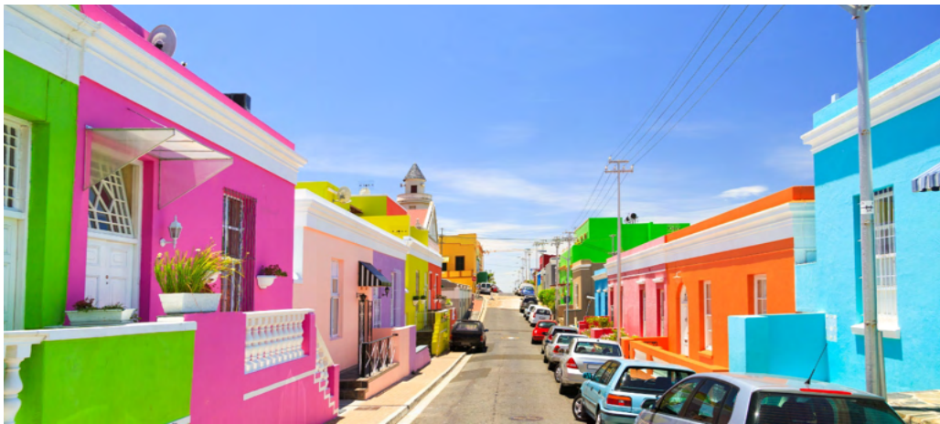
Bo-Kaap, Cape Town